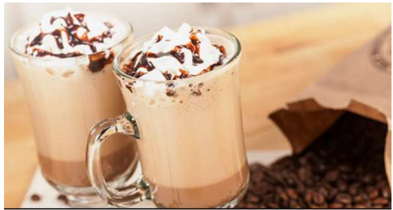
Double Mocha Frappe

Place the ice, coffee, sugar and syrup in a blender. Blend until the frappe is smooth. Pour into a large, tall glasses then garnish with a dollop of whipped cream.